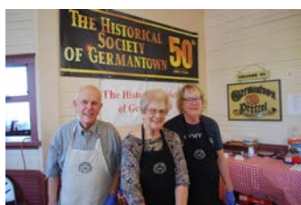
Members served pie and ice cream at the Historical Society's booth at the Pretzel Festival

children had a great time getting to operate the trains!