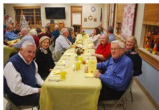
Historical Society Members prepare to enjoy our Annual Dinner in November

We are always looking for new members! New members bring new ideas and energy. In order to stay relevant in today's busy world, this is both needed and appreciated. There is a song with the lyric "Everything old is new again". That's what our Historical Society is— something old- worth preserving and protecting— but with a "twist." We'd love for you to come and join us!