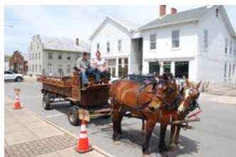
Horse-Drawn Wagon Tour on Opening Day in May

Founders Day in Veterans Memorial Park this August featured pie and ice cream, a football toss for the children, and a very special display of model trains in the Depot presented by the Cincinnati Model Train Club. The